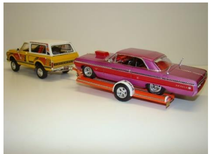
1964 Chevrolet Impala SS Street Rod Show Car By Ed Wahl